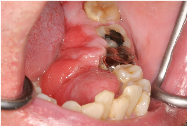
Figure 1 Preoperative view: an exophytic tumor extending all along the lingual aspect of the left mandible.