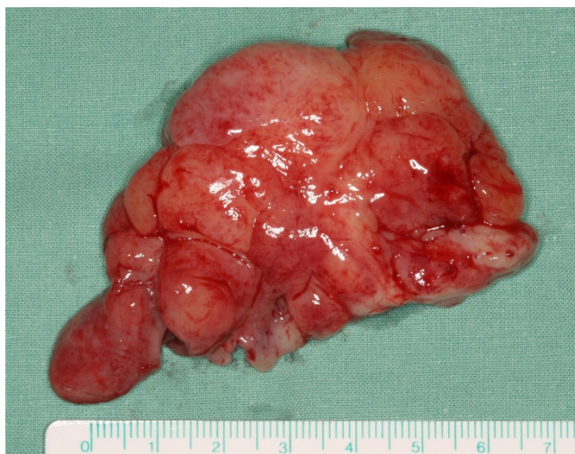
Figure 2 Tumor mass after resection.

Treatment of choice is surgical excision of the solitary lesions, trying to conserve the nerve from which the tumor originates [5]. Malignant transformation of solitary neurofibroma is extremely rare. Recurrence is also rare although some authors suggest higher rate of recurrence at head and neck location of solitary neurofibromas [24-28]. Therefore, the prognosis is quite excellent.