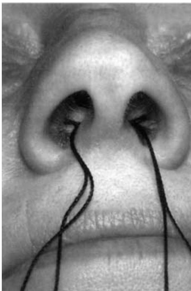
Figure 1 Sponges placed in each nasal cavity. The sponges are attached to a small thread for removal. Once they have contact to liquids, they expand and cover a large area of the mucosa of the nasal septum and the lower and middle turbinates.

According to Kim et al. [16] we handed out a nose-diary in which the patients recorded the number of tissues used per day (each tissue was only used once), the number of sneezing per day and scored symptoms like nasal secretion and nasal congestion on a four-point scale (0 = no, 1 = mild, 2 = moderate, 3 = moderate to severe and 4 = severe), starting two weeks before the first treatment. The occurrence of a dry nose, smelling disorders or epistaxis was recorded daily. All patients were advised not to take any additional nasal therapy. The patients were followed up week 1, 2, 4, 8 and 12. The inspection of the nose diary, the patients' over all impression of the treatment and the clinical examination (anterior rhinoscopy) were done in every follow up and formed the basis for evaluating the study.