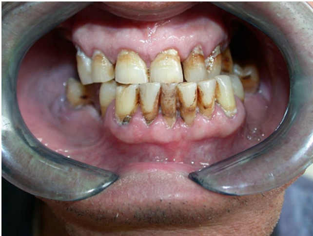
Figure 1 The oral examination revealed Class III malocclusion and left mandibular deviation.

ment decisions involving the lung until immediately after surgery