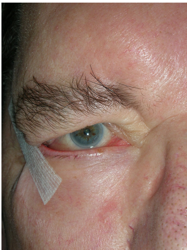
Figure 2 Ectropion corrected by applying adhesive tape.

gently pulled in the ventral direction. Lifting of the lower lid from the eyeball by more than 8 mm is considered pathological and is pathognomonic for atonia of the lower lid. In addition to the evaluation of the lower lacrimal point in the lacrimal lake, the patient makes a subjective assessment using a visual analog scale (VAS 1–10). The patient can rate the reduction in tearing (1 = no improvement, 10 = excellent improvement), cosmetic impairment (1 = no impairment, 10 = considerable impairment) and practicability (1 = not helpful, 10 = very helpful). In all patients, a lid implant (platinum chain) was pretarsally implanted to correct the paralytic lagophthalmos.