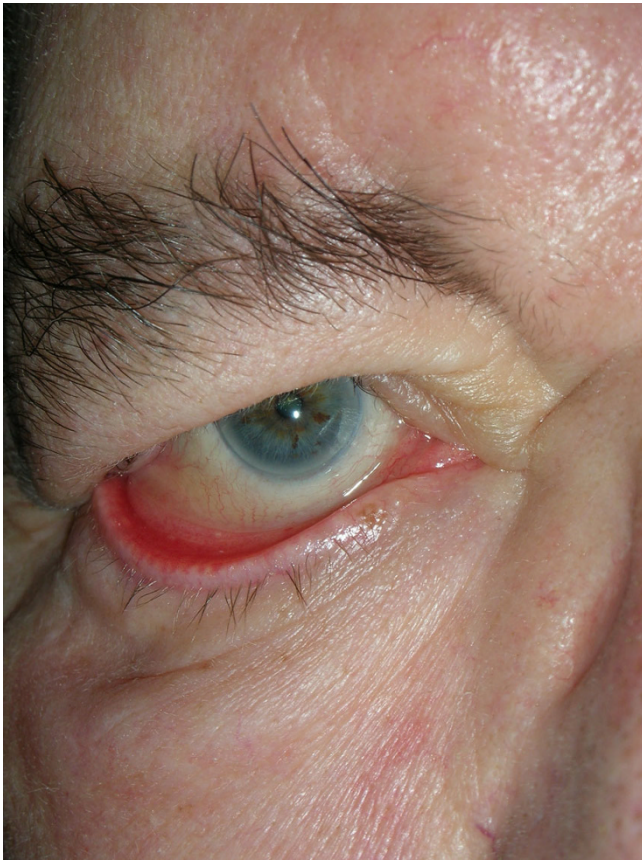
Figure 1 Ectropion in facial palsy.

direction and makes short rapid horizontal movements in the medial direction. The lower lid, on the other hand, is pushed up and moved more strongly in the medial direction, in which the lid opening is shortened by 1 to 2 mm. The medial movement of the lids promotes the locomotion of the lacrimal fluid to the lacrimal lake, the lacrimal point and lacrimal canal and acts as a suction and force pump. The malfunction of the orbicularis oculi muscle in peripheral facial paresis can lead to both lagophthalmos with the risk of corneal desiccation and to a sensory disorder of the nasolacrimal system caused by the loss of the lacrimal pump.