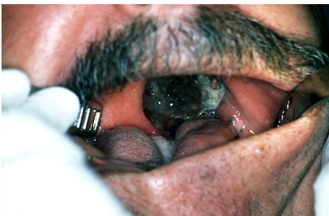
Figure 1 Photograph at initial examination showing an oversized pigmented soft mass (melanoma) arising from the palate.

A computer tomography with contrast revealed pathologically enlarged cervical lymph nodes of the left neck. Signs