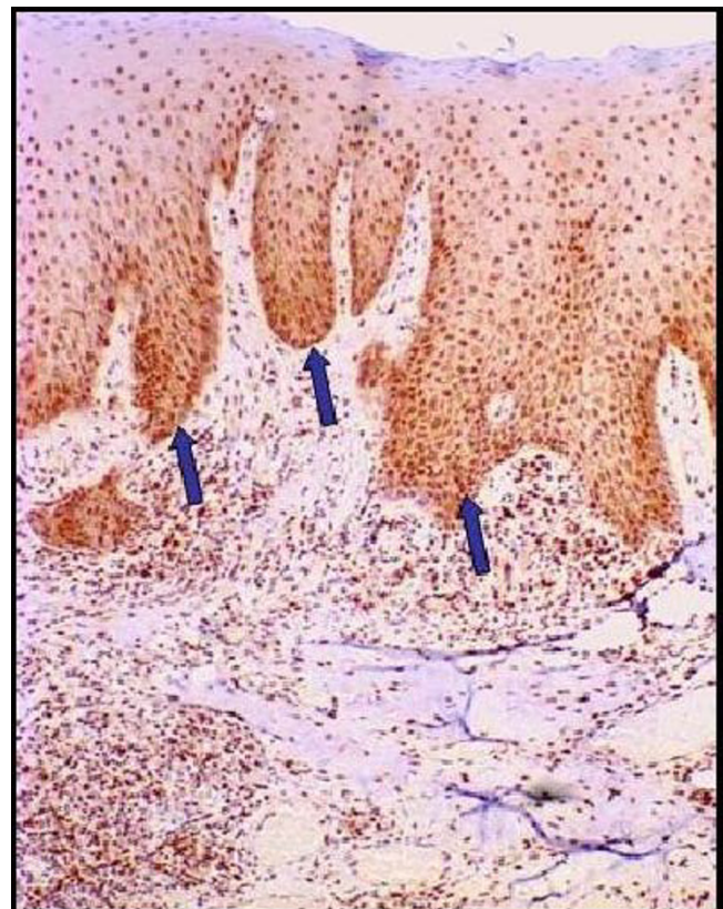
Figure 2 A majority of cells showing nuclear staining with the PCNA antibody (CsA-induced GO group).