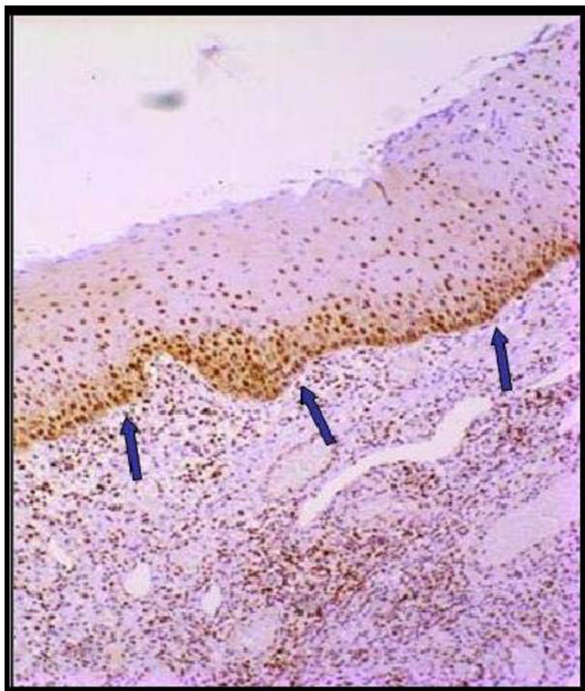
Figure 1 A number of cells showing nuclear staining in the epithelium (control group).

SB conceived and coordinated the study and participated in the collection of sample and data; and writing the manuscript. HU participated in the collection of samples and writing the manuscript. BHÖ carried out tissue processing and immunohistochemistry. SB, BHÖ and ÖEB analyzed the data. ÖEB participated in the design of the study and